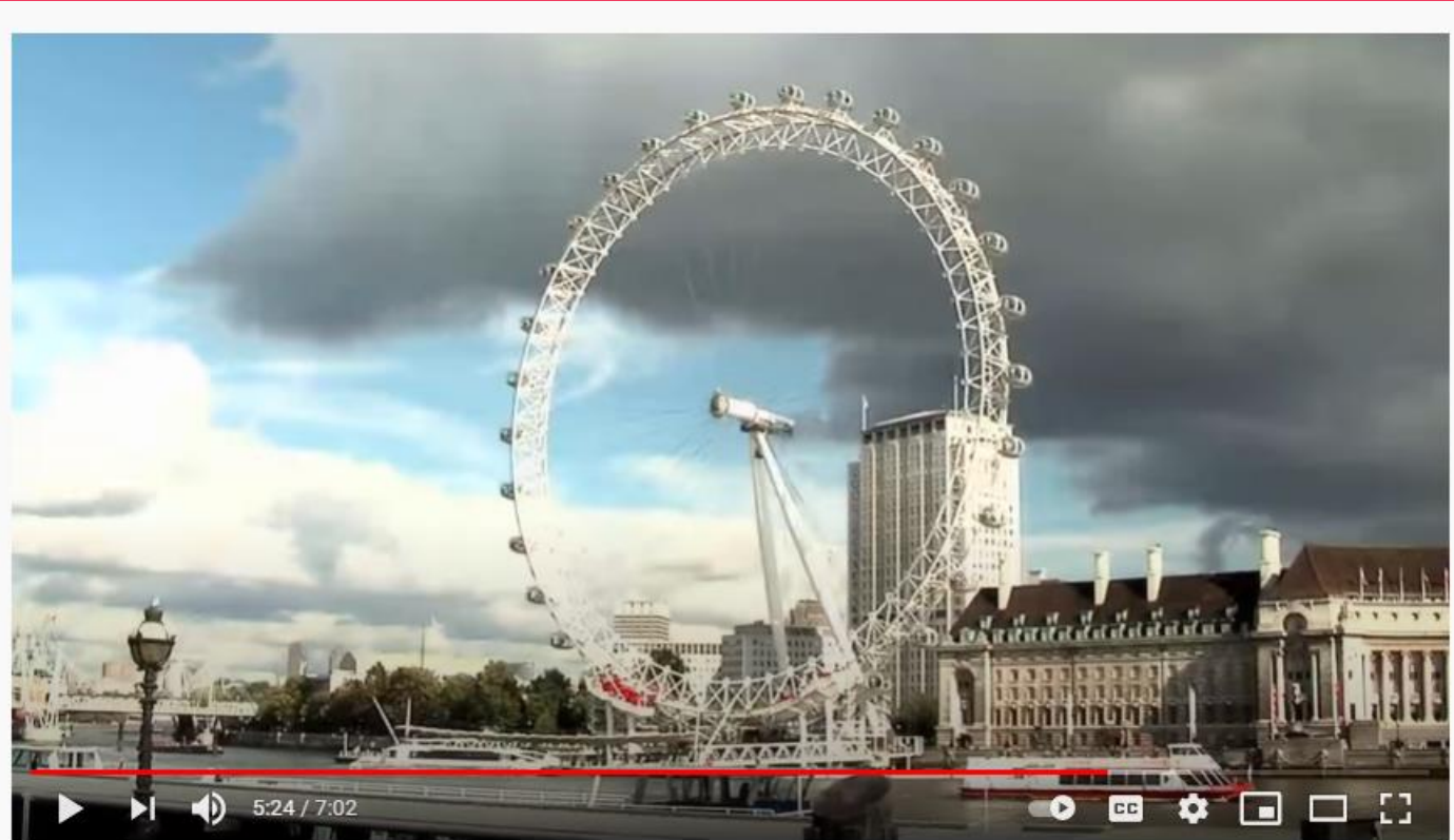
England: Big Ben - Travel Kids in Europe

Today, concentrate on what you learn about The London Eye.