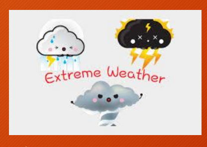
weather gets extreme