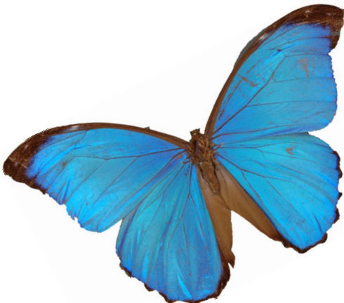
Papilio menelaus from the Linnean collection